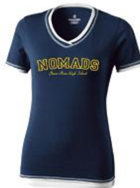
229305- Junior/Girls T-shirt Silk Screen Full Front Girls S-L Junior S-2X $22.00 ea