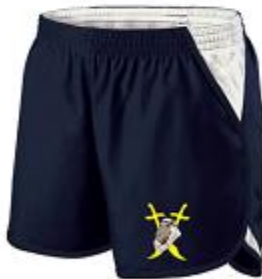
229325-Junior/Girls Short Embroidered left leg Girls S-L Juniors S-2X $ 27.00 ea