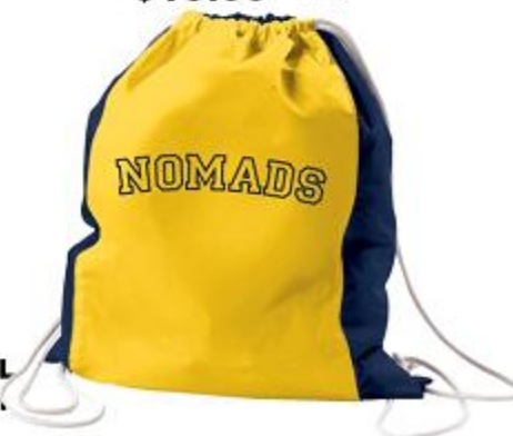
229414-Day Pak Bag Silk Screen Center $13.00 ea

Parents, please bring the order form and a cheque to the office. Order before Nov 20th, so we can get the orders to you by Christmas!