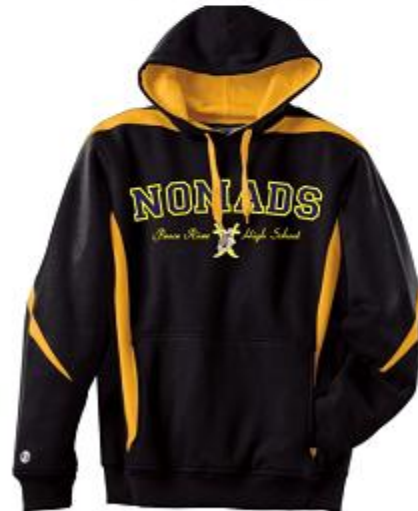
222489-Unisex Hoody Embroidered/Felt Full Front Adult XXS-3X $ 48.00 ea

Parents, please bring the order form and a cheque to the office. Order before Nov 20th, so we can get the orders to you by Christmas!