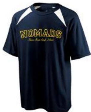
229501- Adult T-shirt Silk Screen Full Front Adult S-3X $22.00 ea