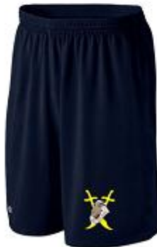
229555-Mens Shorts Embroidered left leg Youth S-L Adult S-3X $ 22.00 ea