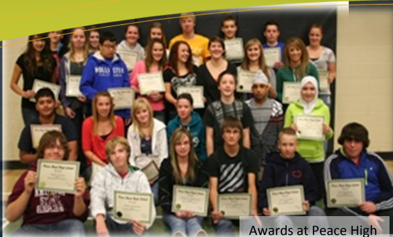
Awards at Peace High