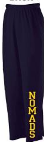
229074- Adult Pant Adult- XS-3X Youth S-L 229674 TALL Adult Pant Adult LT- 3XLT Silk Screen Down right leg $42.00 ea TALL $45.00 ea