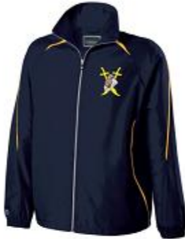
229120- Mens Jacket Youth S-L Adult XS-3X Embroidered logo lft chest $ 59.00 ea